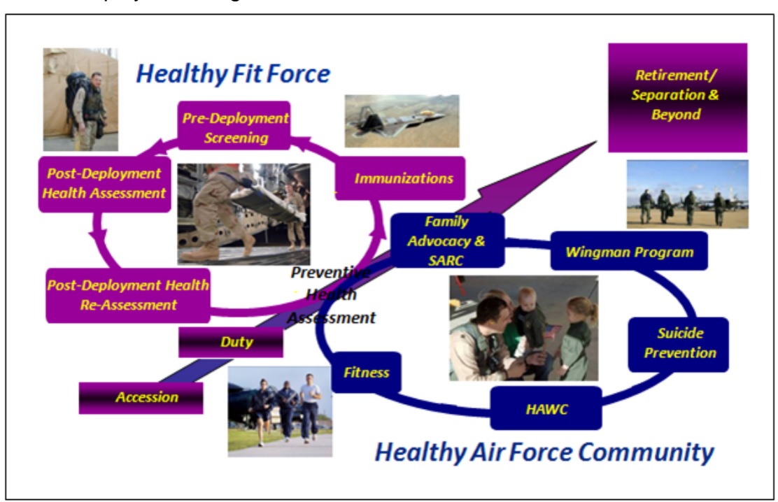
Healthy Fit Force Concept

A fit and healthy force increases the Air Force's capability to withstand the physical and mental rigors associated with combat and other military operations. The ability to remain fit and healthy despite exposure to numerous health threats is a force multiplier at home station and in deployed settings.